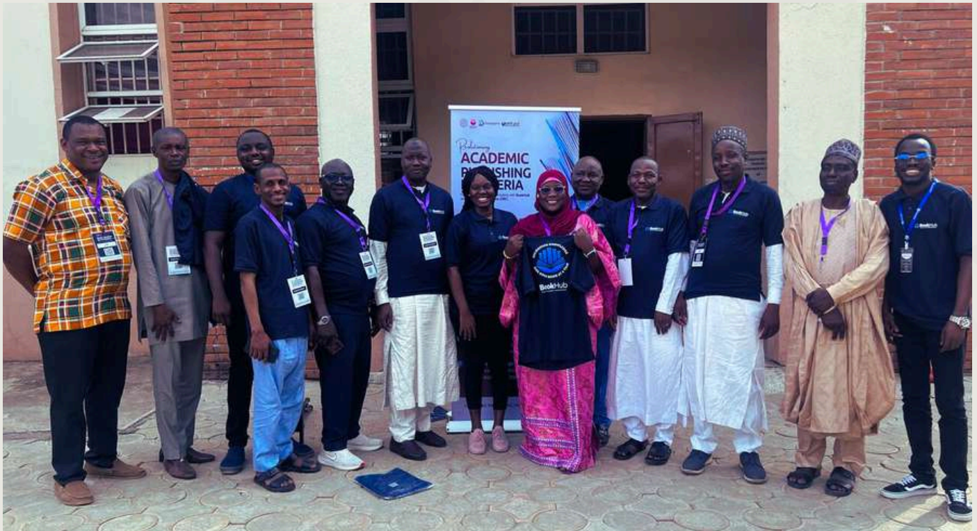
APC Directors and Staff from FUTMINNA Academic Publishing Centre and Datasphir